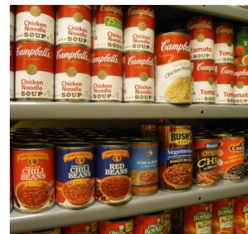
"The Sandburg Food Pantry is now open! Come check it out!"

Our pantry accepts donations of many food and personal essentials items. Toiletries, oil, cleaning supplies, laundry detergent and toilet paper are always in high demand. Donations may be dropped off in the main office.