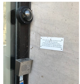
Our buzzer is located on the lower right hand side next to the big handicap button.

parents and older siblings to wait outside for your children/siblings to prevent overcrowding in the common areas and hallways.