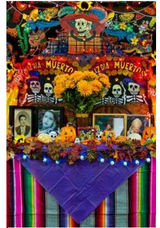
Example of a Day of the Dead altar.

Additionally we are in dire need for items for our haunted hallway. If you have unused costumes (label with size) or Halloween decorations please send in your donations with your child now through October 9th